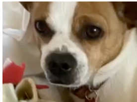
Before and After 2 year old dog w/ cancerous growth on lip after wandung for 2-3 wks.