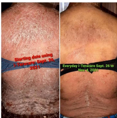
Psoriasis after roughly one month of 'wandung'!