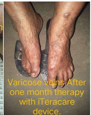
Varicose veins After one month therapy with iTeracare device.