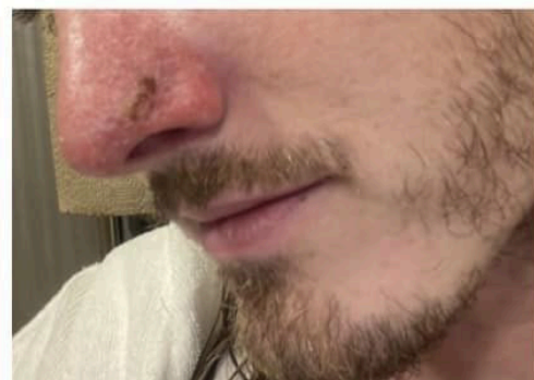
One week Monday