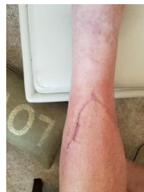
M.D. said leg on left would never get better. Right - after about a week of 'wandung'!