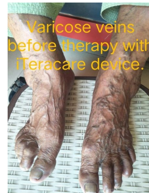
Varicose veins before therapy with iTeracare device.