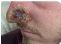
Day 7 on antibiotics necrosis continues