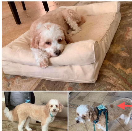
Notice the dark spot on dogs back from a skin infection. Vet said it was permanent. After a few months of 'wandung' a few minuter per day the spot is GONE!