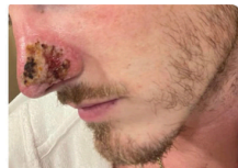
4 days after wandung