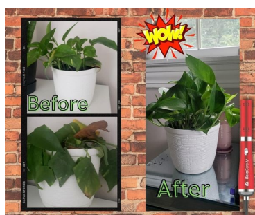
Plants love it too!